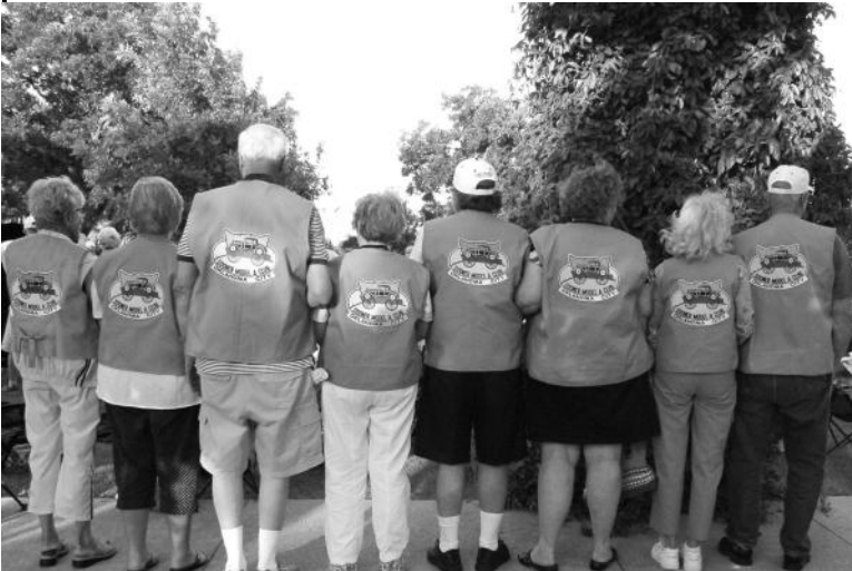
Here we are proudly wearing our new vests.