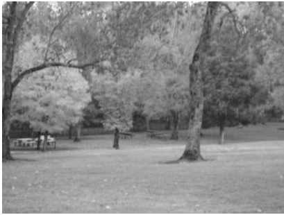
Check out the newsletter on line to see the beautiful color