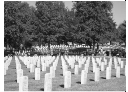
National Cemetery at Ft. Smith

Sallisaw for a good lunch and then headed to Van Buren out Highway 59 which was a curvy, picturesque road. We all checked in at the Holiday Inn Express and got settled. By then, it was time to eat again and we met at a Mexican restaurant in Van Buren for dinner.